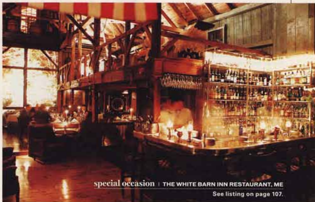
special occasion | THE WHITE BARN INN RESTAURANT, ME

In Portland, a city where the outstanding restaurants are generally celebrated for their rustic appeal, Hugo's stands out for its precise execution and witty urbane sensibility. Chef Rob Evans, who cooked at The Inn at Little Washington and The French Laundry before coming to Maine, offers constantly changing prix fixe, tasting, chef's and bar menus that have been deservedly lauded for their steadfast use of local ingredients. But those menus never take themselves too seriously: A recent entry was Maine soft-shell lobster and potato "rice-a-roni" (yes, that's what they called it), dressed perfectly with aged pecorino, orange Agramato olive oil and salted fines herbes.